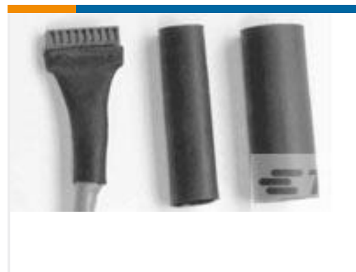
TE Part #CA0766-000 DWP-125-1/2-2-1.25IN