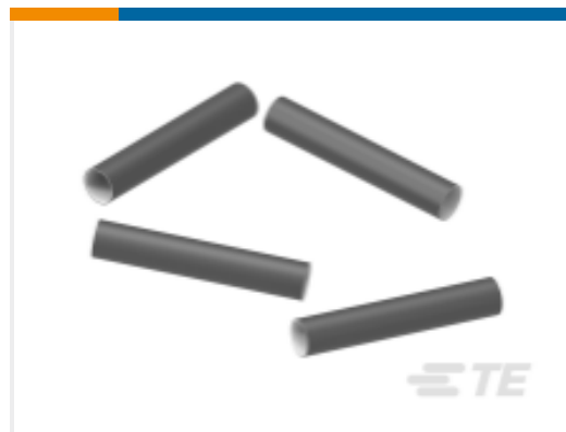
TE Part #EP79346001 FL2500-NO.5-P3-0-51MM