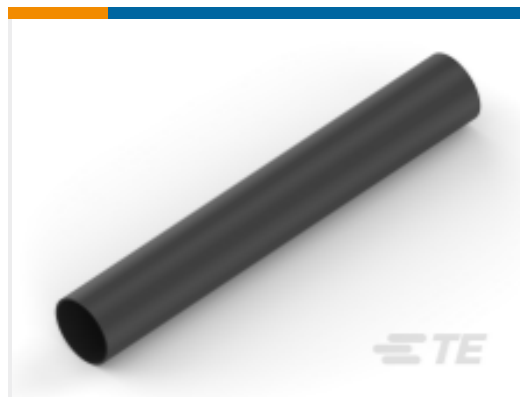
TE Part #CA0767-000 DWP-125 Heat Shrink Tubing