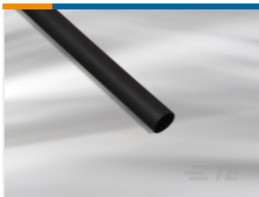
TE Part #NB07186001 BATTU Heat Shrink Tubing