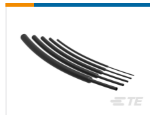
TE Part #EG6995-000 RNF-100-1/2-BK-FSP-250KFT