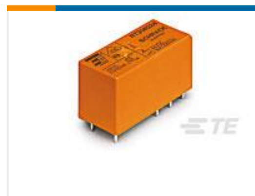
TE Part #4-1393243-3 RT423730