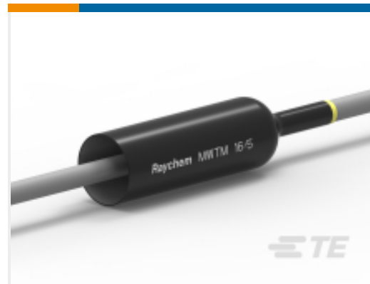
TE Part #262852-000 MWTM-16/5-1000/S(S25)