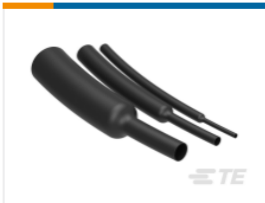
TE Part #5069764008 CGPT 2:1 Heat Shrink Tubing