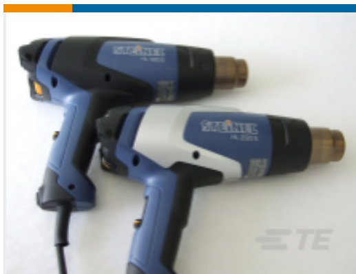
TE Part # EG8162-000 HL1920E-230V-EURO