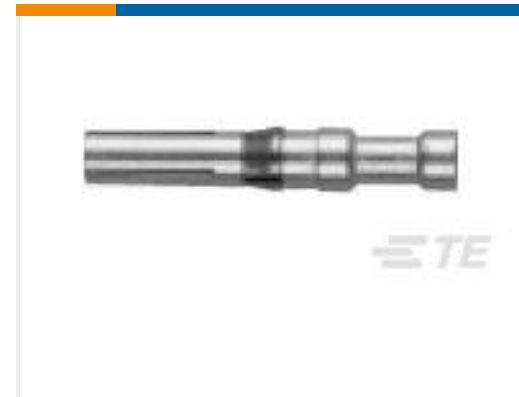
TE Part #4-1105301-1 HVT-C-Bu.Ag.2,5 qmm