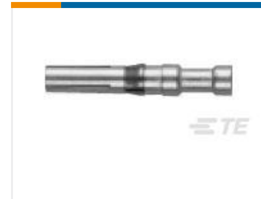
TE Part #2-1105301-2 HVT-C-Bu.Au.0,75-1,0 qmm