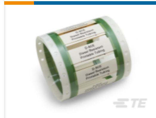
TE Part #772259-000 D-SCE Fluid Resistant Sleeves