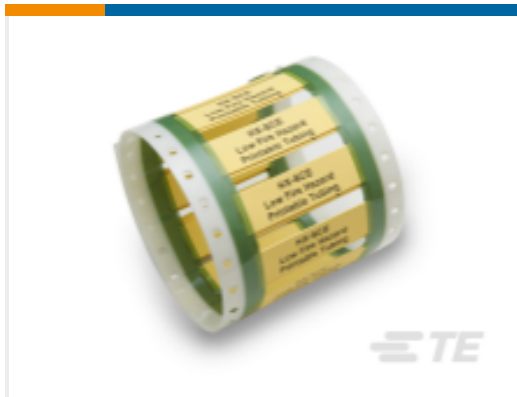
TE Part #F18659-000 HX-SCE Low Fire Hazard Sleeves