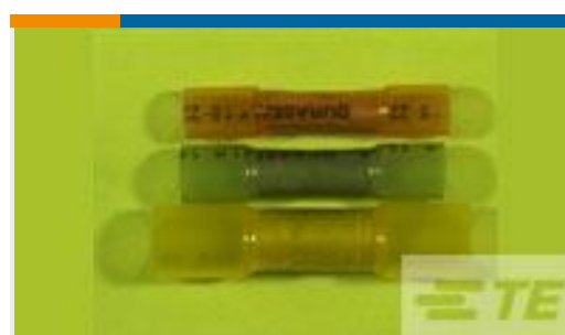
TE Part #CC2633-000 D-406-0002CS100