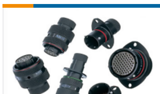
TE Part #AS612-35PN PLUG BOOT TERMINN TYPE 6