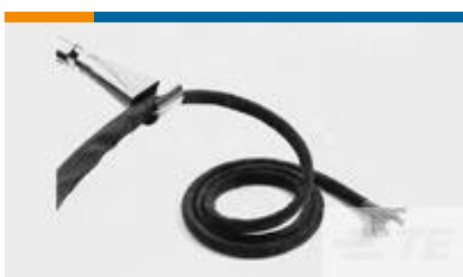
TE Part #CB03374007 RW-200-E-1/2-0-SP