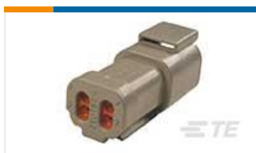
TE Part #DTM04-4P-E003 REC, 4P, GRY, N, CAP