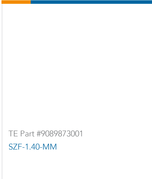
TE Part #9089873001 SZF-1.40-MM