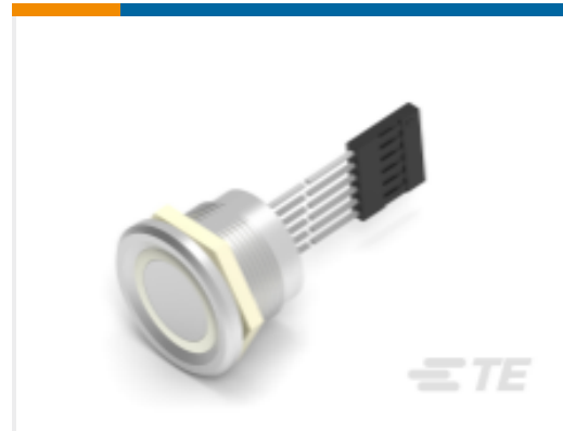
TE Part #2342843-1 AVP22M CONC. AIO RGB R 500MM /1X6