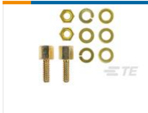
TE Part #5205817-1 KIT SCREWLOCK FEMALE