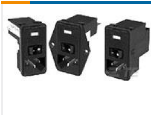
TE Part #7-6609107-1 PS0S0DS30=C1183