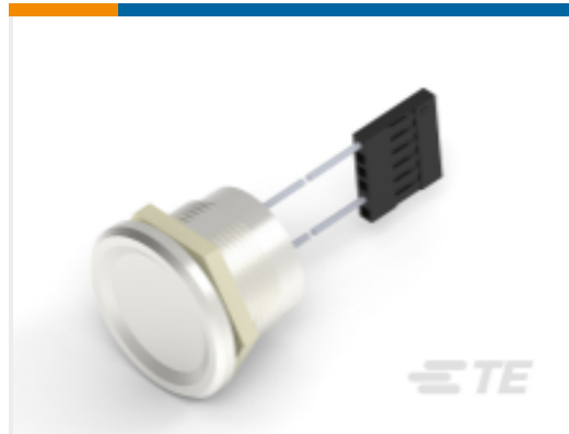
TE Part #2342844-4 AVP22M CONC. S16 NL 500MM/1X6