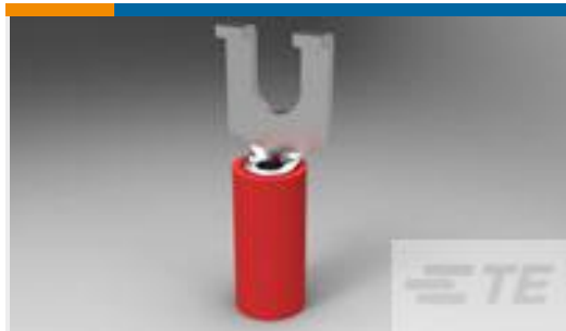
TE Part #322777 PIDG SPDFLG 22-16COMM22-18MIL6