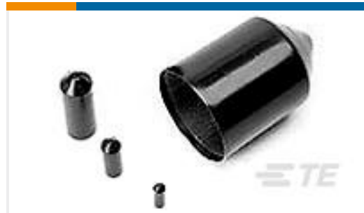
TE Part #016897-000 101A031-25/86-0