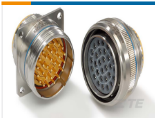
TE Part #ZPF000000000008208 983-6KE 10-06 PN-L