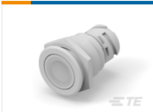
TE Part #K1160479 Push button switch TS-211-GE11