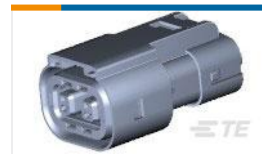
TE Part #2103149-1 PLUG, HVIL ONLY, KEY A, HVA280-2PHI