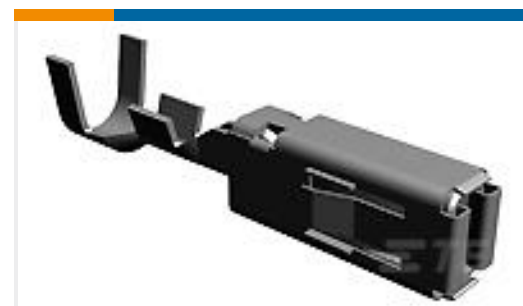
TE Part #1-968857-1 AMP MCP 2.8, CONTACT SWS