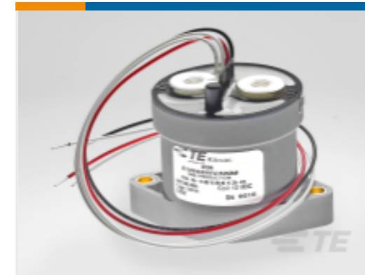
TE Part #4-1618413-9 EV600HSANM = CONTACTOR, SPST-NO 24V COIL