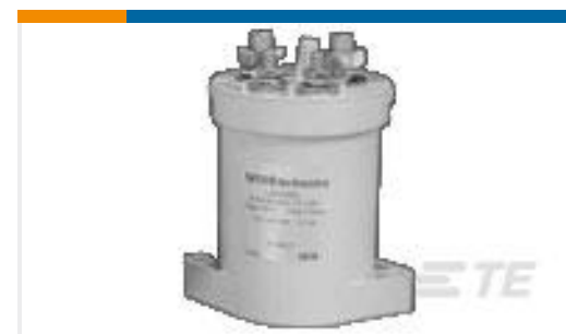
TE Part #3-1618389-7 LEV100A4ANG=RELAY, 12Vdc SPST-NO