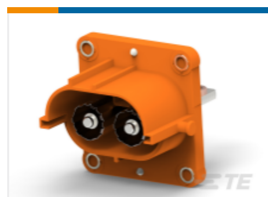
TE Part #1-2322122-1 HVP800 2P HEADER ASSY