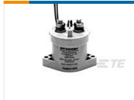
TE Part #1-1618002-8 EV200HAANA=RELAY, SPST-NO WITH