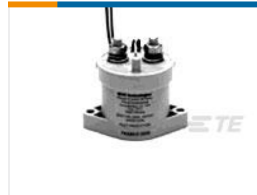
TE Part #2-1618396-7 EV200GAANA=RELAY, EV200 SPST-NO