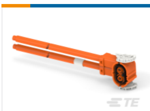
TE Part #1-2286945-5 2POS,HVP800,90 DEG,50 SQMM,COD A