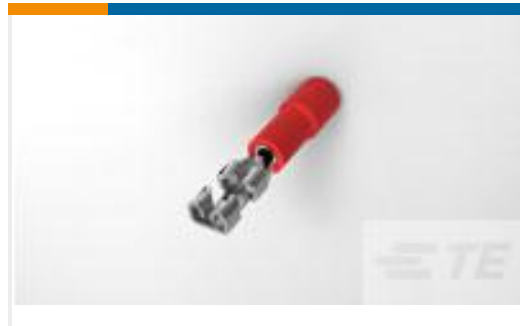
TE Part #640925-1 RECEPT,PIDG FASTON 22-18 110