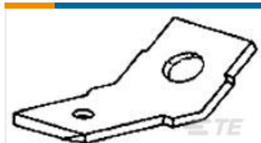
TE Part #62576-1 187 FASTON TAB BR