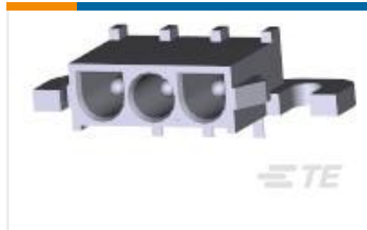
TE Part #3-350943-0 03P UMNL HDR ASSY R/A 94VO LF