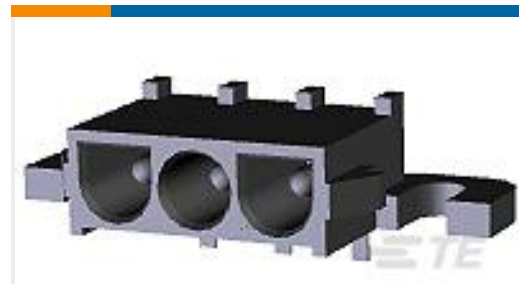
TE Part #1586892-3 03P UMNL HDR ASSY R/A, GW V0