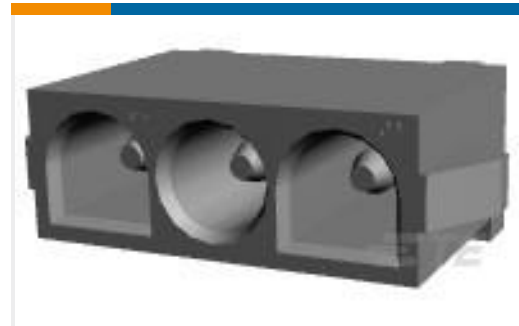
TE Part #350429-4 03P UMNL PIN HDR ASSY NATL LF