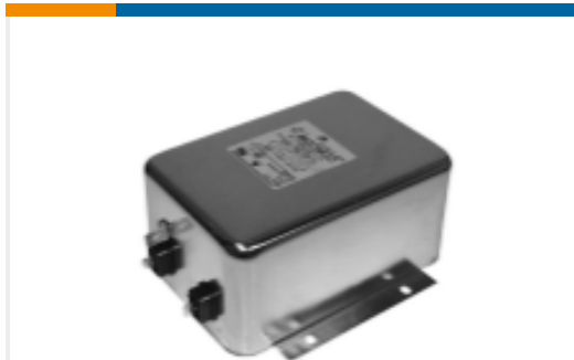
TE Part #6609046-4 Single Phase Filters, Corcom T Series