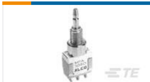
TE Part #2-1437567-8 MPA106D=SW P/B ON/OFF SPDT