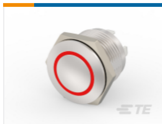
TE Part # 2213774-3 AV16 SPM 0.4VA FIX RING LED RED 12V