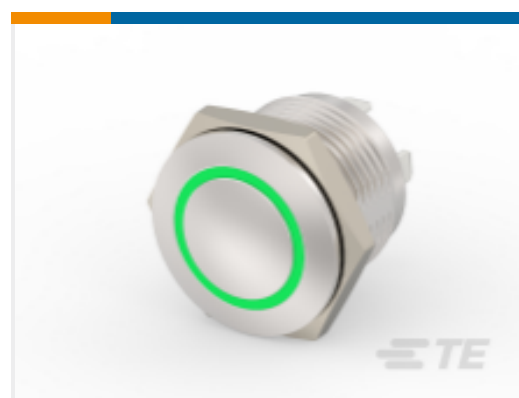
TE Part # 2213774-7 AV16 SPM 0.4VA FIX RING LED GREEN 12V