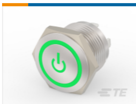
TE Part # 2213775-7 AV16 SPM 0.4VA POWER LED GREEN 12V