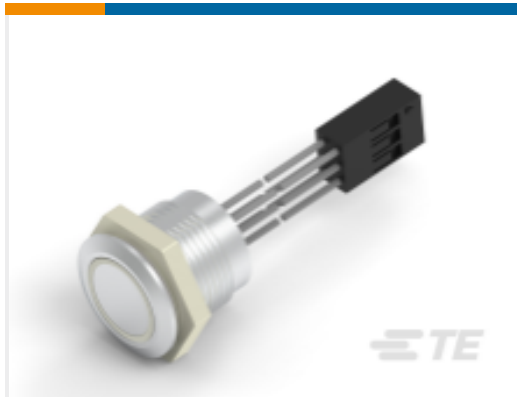
TE Part #2342832-7 AVC16M FLAT AIO RGB R 500MM/2X3