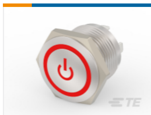
TE Part # 2213775-3 AV16 SPM 0.4VA POWER LED RED 12V