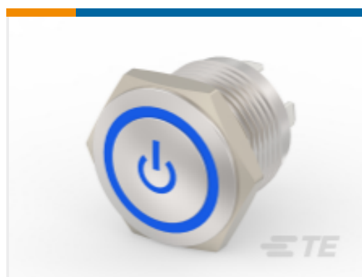
TE Part # 2213775-9 AV16 SPM 0.4VA POWER LED BLUE 12V