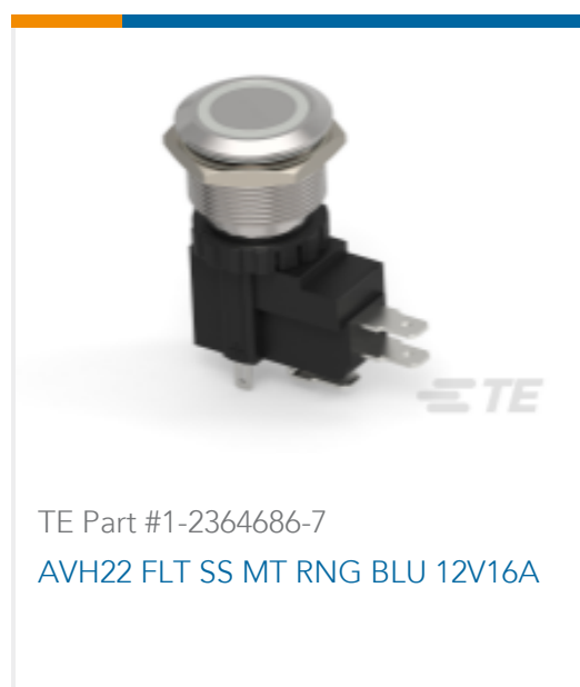
TE Part #1-2364686-7 AVH22 FLT SS MT RNG BLU 12V16A