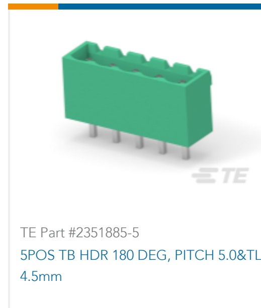
TE Part #2351885-5 5POS TB HDR 180 DEG, PITCH 5.0&TL 4.5mm