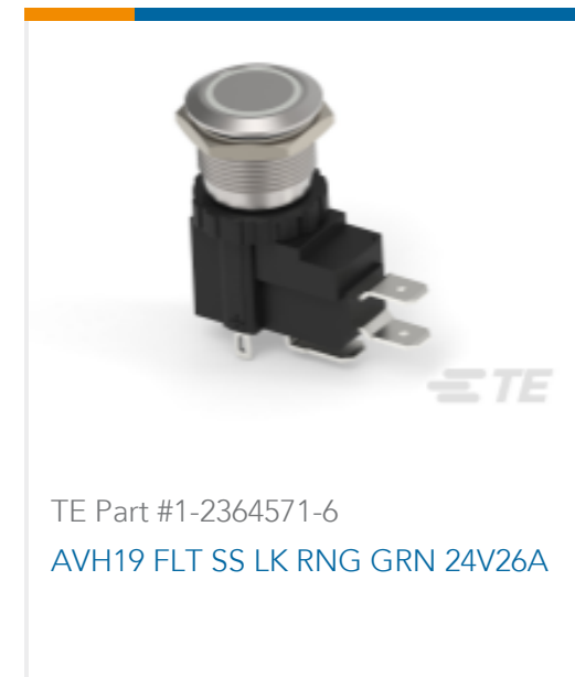
TE Part #1-2364571-6 AVH19 FLT SS LK RNG GRN 24V26A