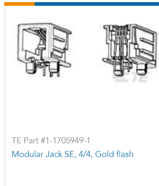
TE Part #1-1705949-1 Modular Jack SE, 4/4, Gold flash