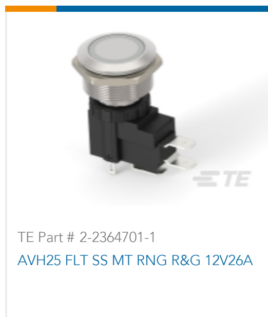
TE Part # 2-2364701-1 AVH25 FLT SS MT RNG R&G 12V26A