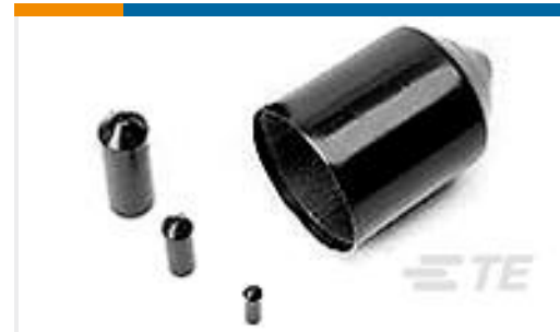
TE Part #016897-000 101A031-25/86-0