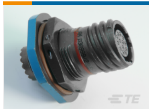
TE Part #YACT24JD18AN000000 JAM NUT RECEPTACLE