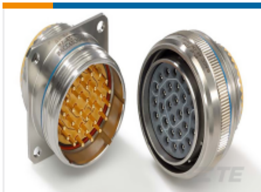
TE Part #ZPF000000000008208 983-6KE 10-06 PN-L