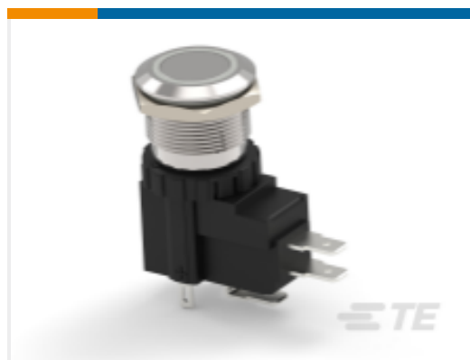
TE Part #1-2364570-9 AVH19 FLT SS MT RNG BLU 24V16A