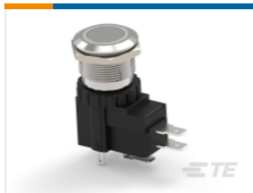
TE Part #2-2364570-0 AVH19 FLT SS LK RNG BLU 24V16A