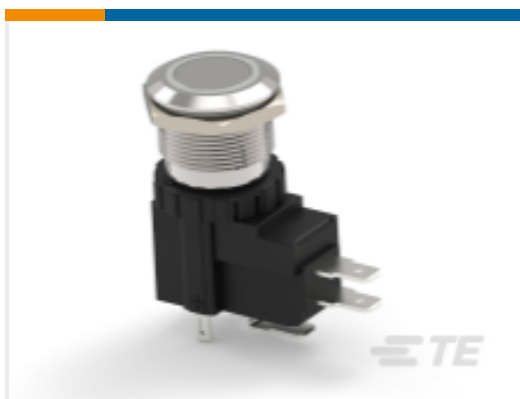
TE Part #1-2364570-7 AVH19 FLT SS MT RNG BLU 12V16A