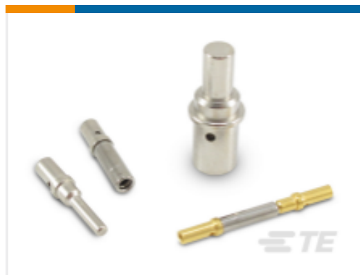
TE Part #0462-209-16141 DEUTSCH Solid Contacts