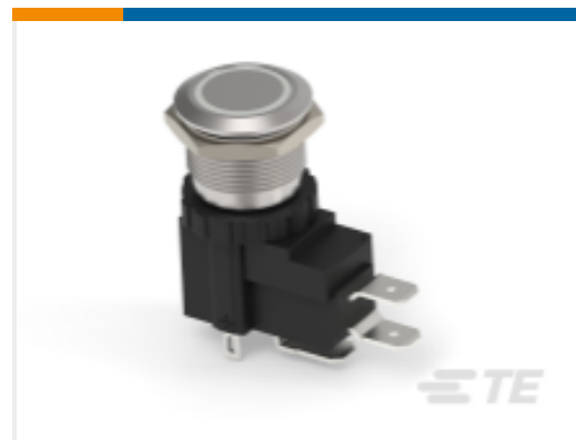
TE Part #2-2364571-0 AVH19 FLT SS LK RNG BLU 24V26A