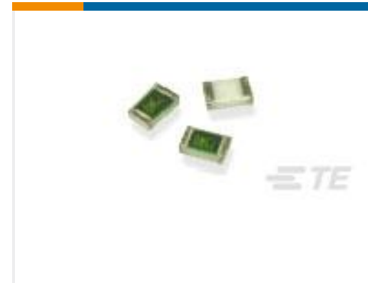
TE Part #2176090-3 RP 1J 0.166W 137K 0.1% 25PPM 1K RL