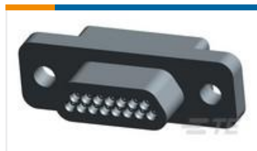
TE Part #1532180-3 M83513/03-B03N, MCKS-N1-B-15P6G9-18.0