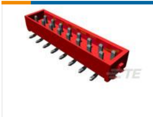
TE Part #9-338728-0 MICROM. MOB SMD CON