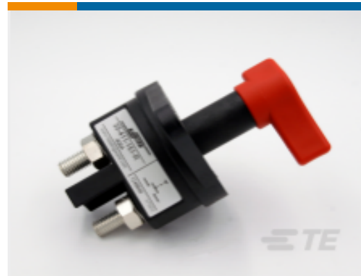
TE Part #K1121363 Battery Disconnecter 35-413-151-R