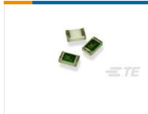
TE Part #9-1676481-2 CPF 0603 56K 0.1% 25PPM 1K RL