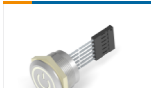
TE Part #2342837-5 AVC22L FLAT S16 RGB RL 500MM/1X6