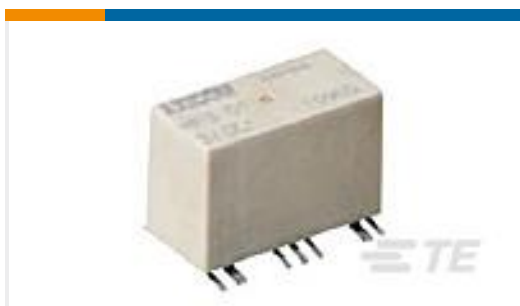
TE Part #1462051-5 HF357=50OHM140MW24V MONO