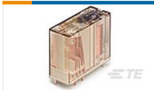
TE Part #1-1393258-7 V23047-A1024-A511