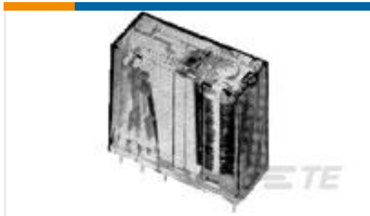
TE Part #1-1393258-5 V23047-A1024-A501