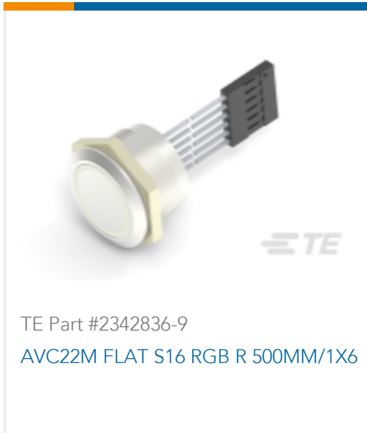
TE Part #2342836-9 AVC22M FLAT S16 RGB R 500MM/1X6