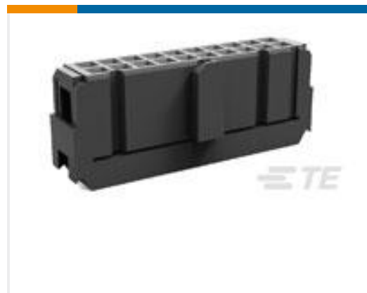
TE Part #1658621-1 10 NOVO MIL/CTR 15DP,LEAD FREE