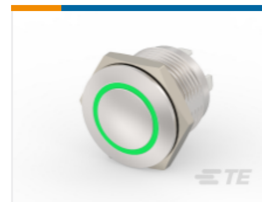
TE Part # 2213774-7 AV16 SPM 0.4VA FIX RING LED GREEN 12V