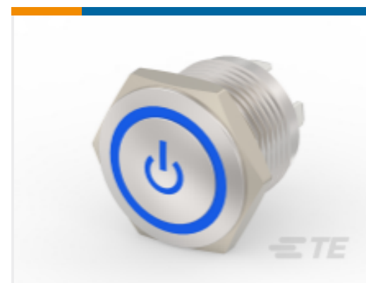
TE Part # 2213775-9 AV16 SPM 0.4VA POWER LED BLUE 12V