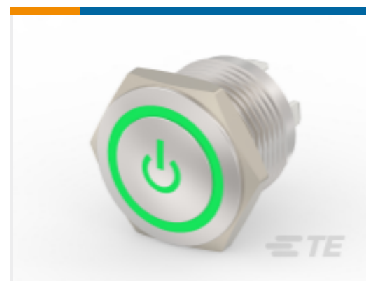
TE Part # 2213775-7 AV16 SPM 0.4VA POWER LED GREEN 12V