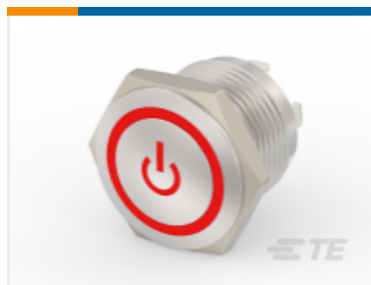
TE Part # 2213775-3 AV16 SPM 0.4VA POWER LED RED 12V