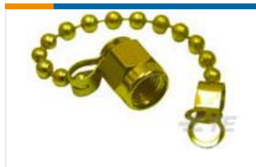
TE Part #3-1478985-0 SMA PLG DUST CAP & CHAIN GB