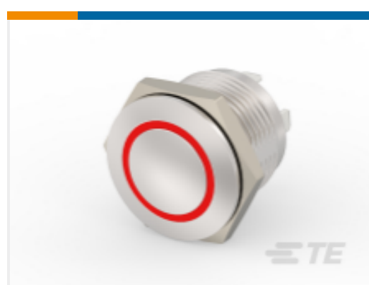
TE Part # 2213774-3 AV16 SPM 0.4VA FIX RING LED RED 12V