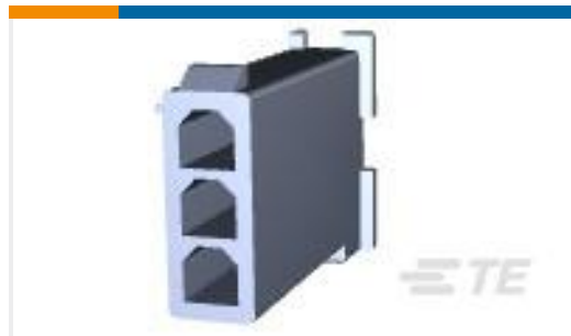
TE Part #172234-1 3P MINI UNIVERSAL MATE-N-LOK CAP HOUSING