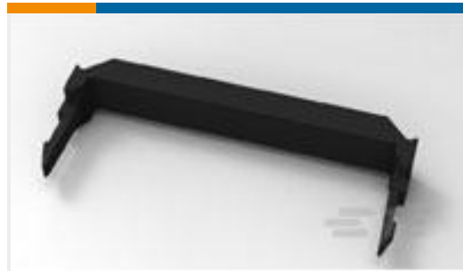
TE Part #499252-9 014 STRAIN RELIEF A-L RCPT