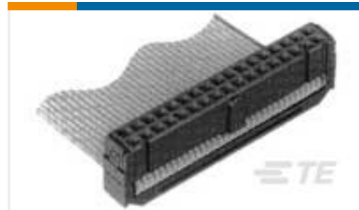
TE Part #1658622-2 14 NOVO MIL/CTR 30DP, LEAD FREE