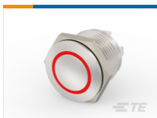
TE Part # 2213774-3 AV16 SPM 0.4VA FIX RING LED RED 12V