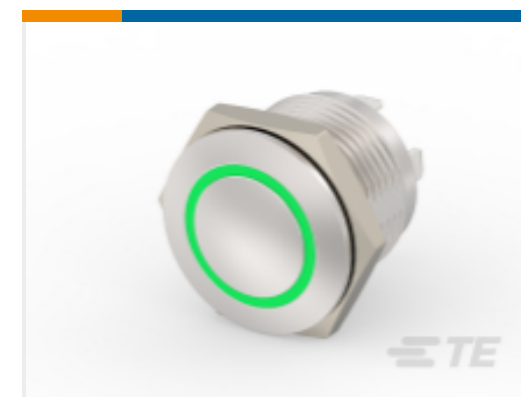
TE Part # 2213774-7 AV16 SPM 0.4VA FIX RING LED GREEN 12V