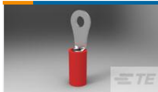
TE Part #320882 PIDG R 22-16 COMM 22-18 MIL 4