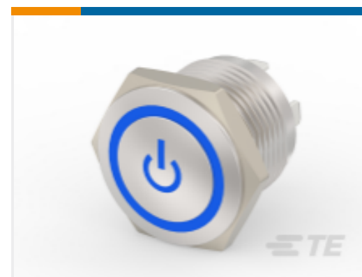
TE Part # 2213775-9 AV16 SPM 0.4VA POWER LED BLUE 12V