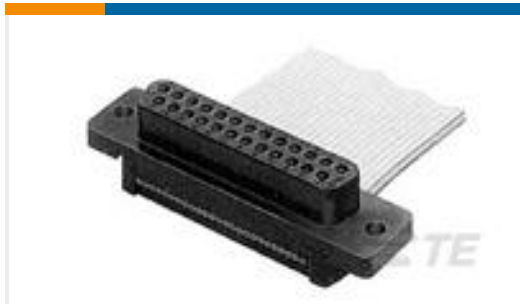
TE Part #1658614-4 09 POS HDF RCPT, AP, LEAD FREE