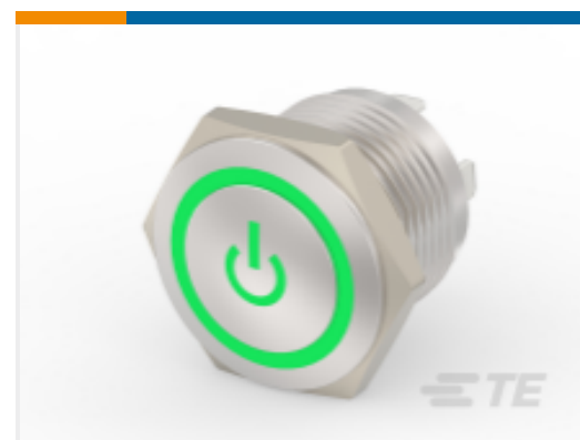
TE Part # 2213775-7 AV16 SPM 0.4VA POWER LED GREEN 12V