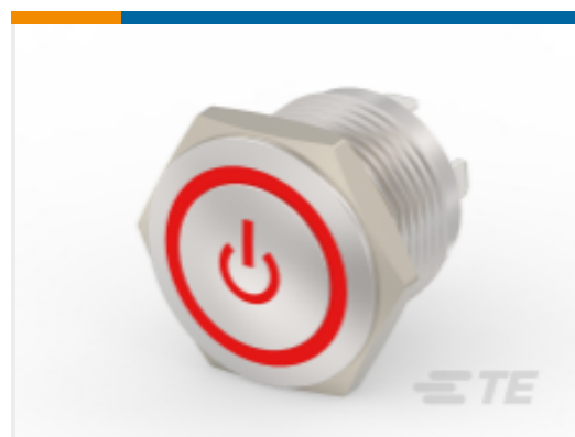
TE Part # 2213775-3 AV16 SPM 0.4VA POWER LED RED 12V