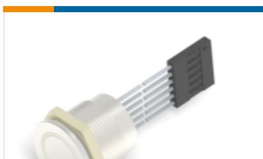
TE Part #2342839-4 AVP19M FLAT S16 RGB R 500MM/1X6