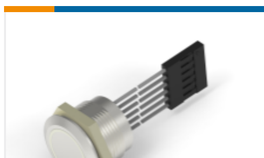
TE Part #2342834-5 AVC19L FLAT S16 RGB R 500MM/1X6