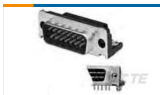
TE Part #5747842-3 25 MSFL PLUG RA 318 (IN,FM,BL)