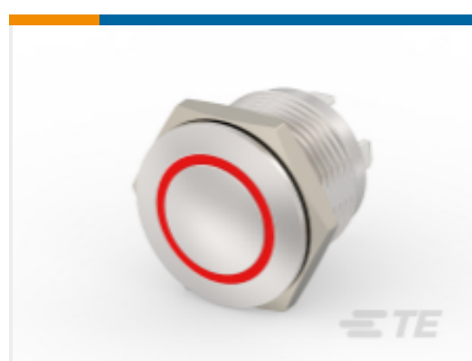
TE Part # 2213774-3 AV16 SPM 0.4VA FIX RING LED RED 12V