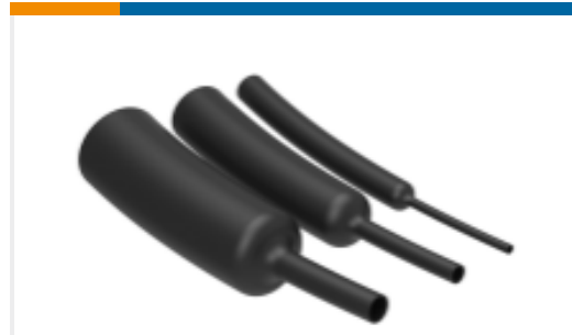
TE Part #CH17364001 RNF-3000 Heat Shrink Tubing