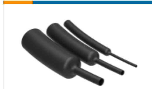
TE Part #3079216001 RNF-3000-NR555-0-40MM