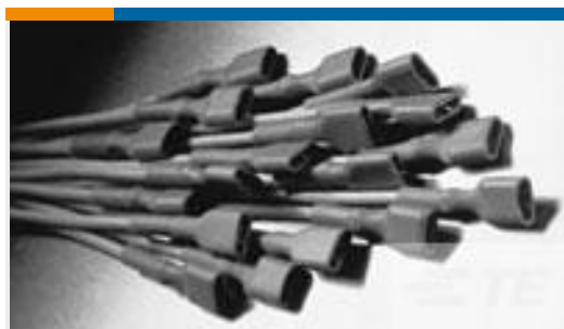
TE Part #5426974001 LSTT-25.4-0-SP