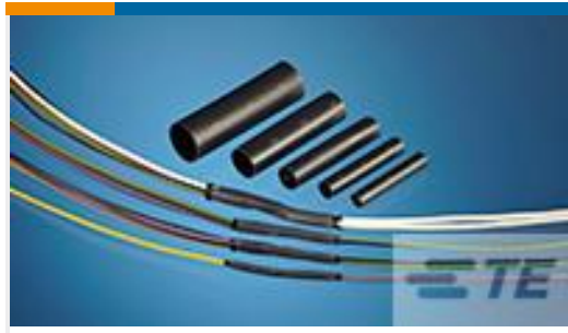
TE Part #CH03056001 QSZH-125-NR4-75MM