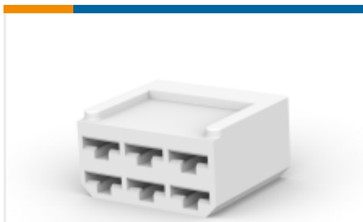
TE Part #880297-1 6 WAY FF 250 HOUSING REC PA 6.6 NATURAL