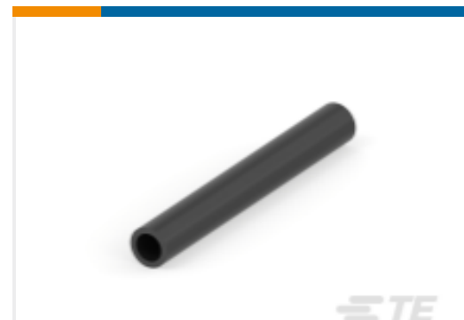
TE Part #CH35526001 QSZH Heat Shrink Tubing