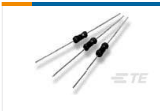
TE Part #3-1879354-8 RR03 5% 11R AMMO