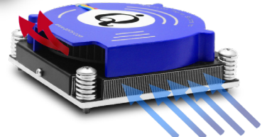
dualFLOW™ airflow direction