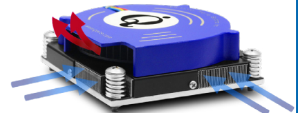
quadFLOW™ airflow direction