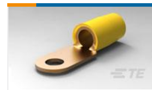
TE Part #324050 TERMINAL,T-N R 4 1/4