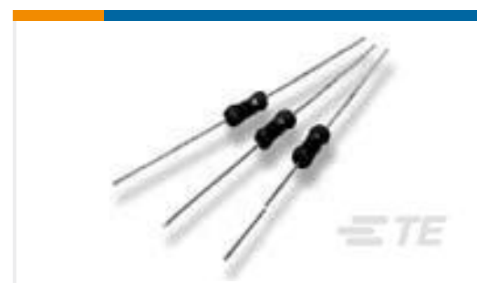
TE Part #3-1625892-7 3W SM M/OX 5% 2K2