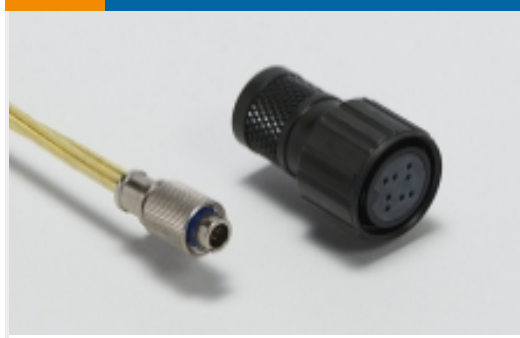
Standard Circular Connectors(9180)