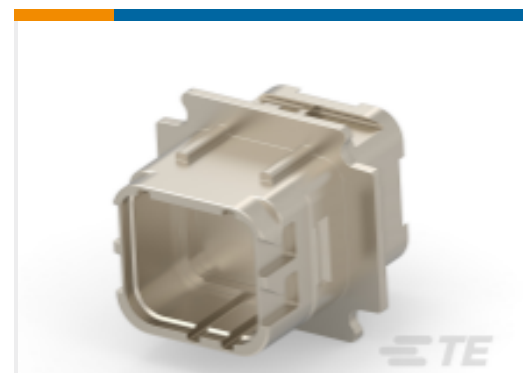
TE Part #ZPF000000000146309 DMC-MD 26 G-K-T