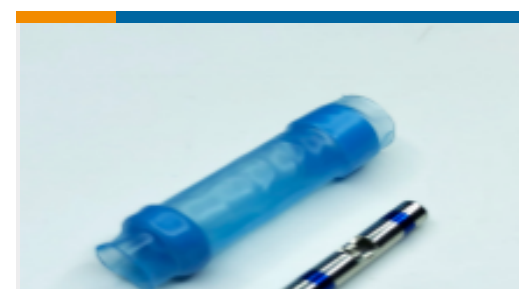
TE Part #EG9627-000 D-200-86