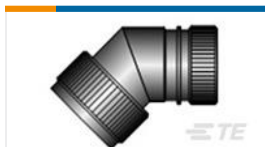
TE Part #F00708-000 HEX40-AC-45-23-A13-2