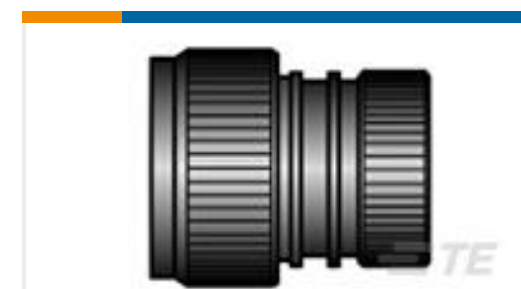
TE Part #466338-000 HEXA6-AB-00-02-A25-1