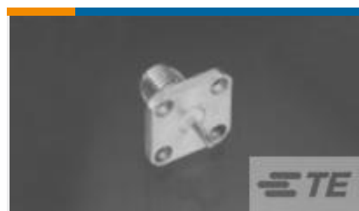
TE Part #1052422-1 2052 0000 02,SMA FM JACK RECPT