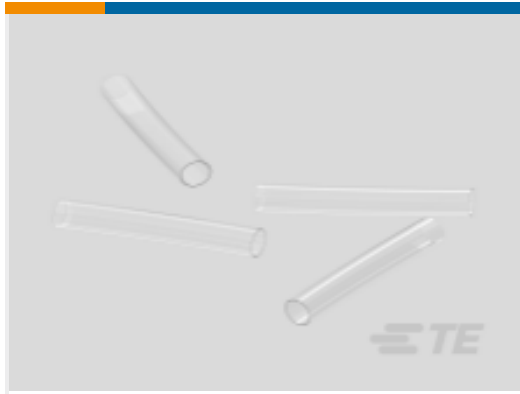
TE Part #NB16104001 RT-375 Heat Shrink Tubing