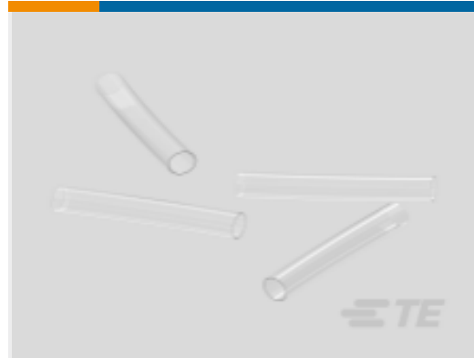
TE Part #9456256001 RT-375-1/4-X-RS-288-5213