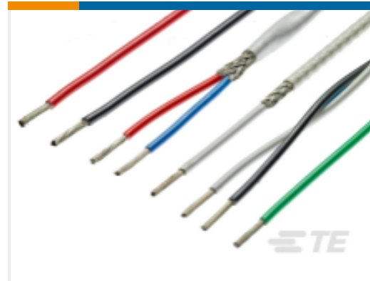
TE Part #9360713001 99M0111-20-2