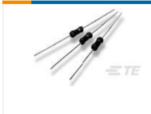
TE Part #2-1879352-4 RR02 5% 3R0 AMMO