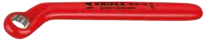
98 01 14