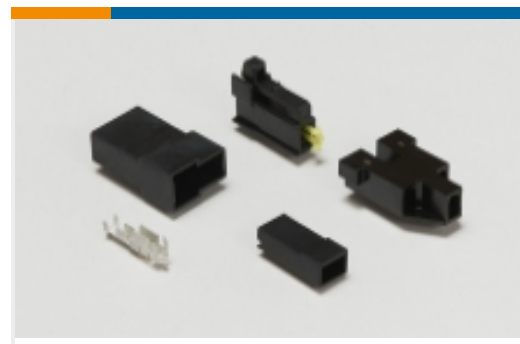
Magnet Wire Terminals(336)