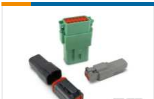
TE Part #DT04-2P DEUTSCH DT Series Housings & Connectors