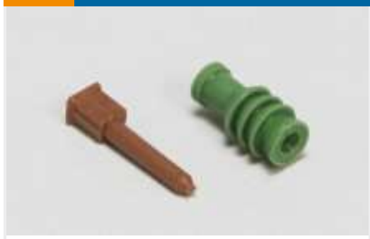
Automotive Seals & Cavity Plugs(26)