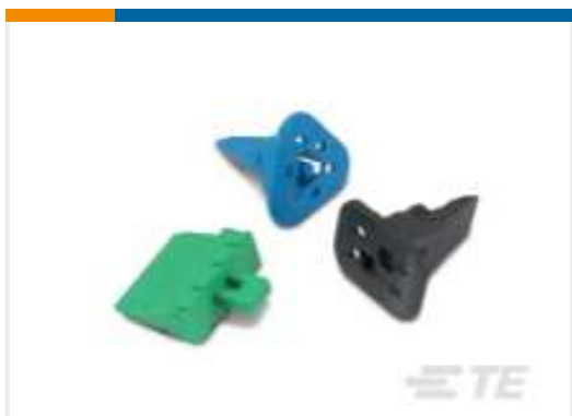
TE Part #W2P DEUTSCH DT WEDGELOCKS