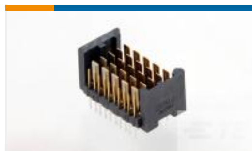
TE Part #5120874-1 HS3 10 ROW RECEPTACLE ASSY W/M