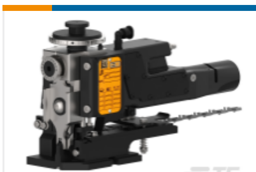
TE Part #2150677-2 OCEAN_2.0_APPLICATOR-E-100F