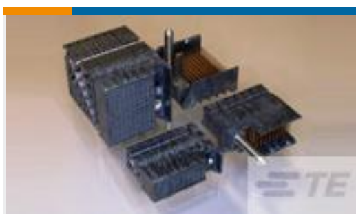
TE Part #2007838-2 IMP100S,H,V4P16C,UG,DEW39,4.9