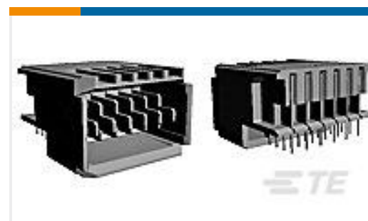
TE Part #120974-1 UPM HEADER ASSY, LF