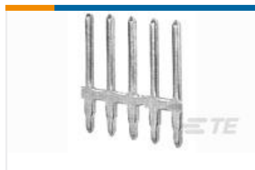
TE Part #3-87878-2 MOD II POST PLTD 50 AU