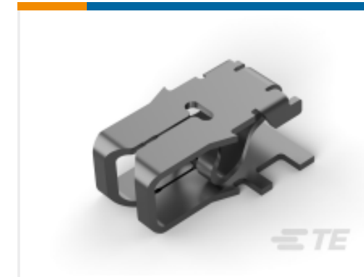
TE Part # 964337-2 CODE WIRE SIZE : 4