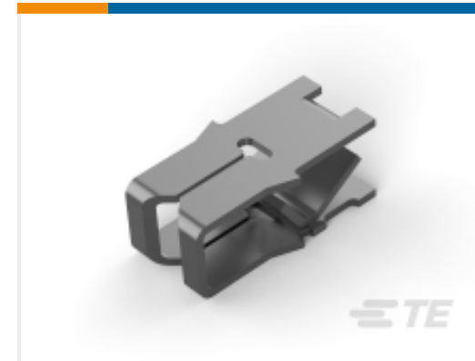
TE Part # 926851-4 MAG-MATE LEAF KONT