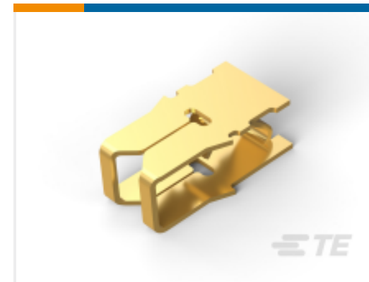
TE Part # 926850-7 MAG-MATE LEAF KONT