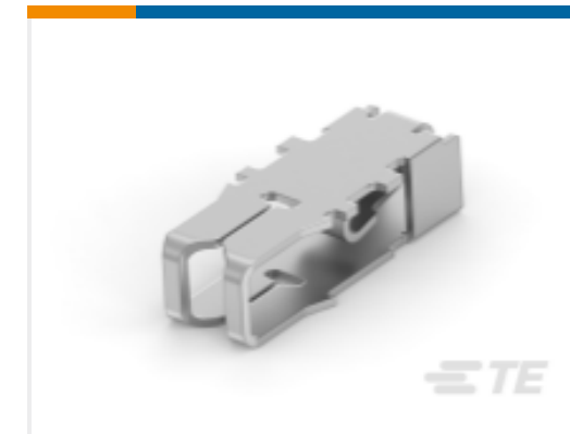
TE Part # 964108-2 MAG-MATE KONTAKT