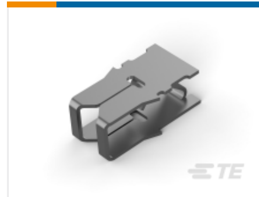
TE Part # 926850-1 MAG MATE LEAF KONT