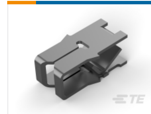
TE Part # 926851-1 MAG MATE LEAF KONT