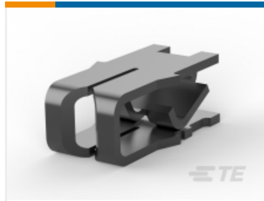
TE Part # 926852-2 MAG MATE LEAF KONT