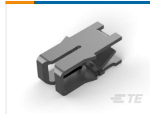
TE Part # 928770-2 MAG-MATE LEAF CONT.