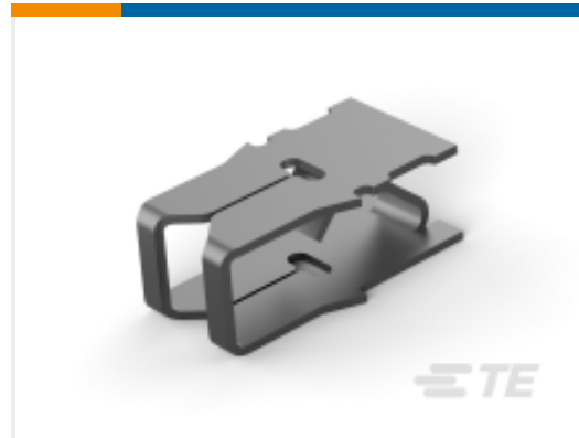
TE Part # 926850-2 MAG MATE LEAF KONT