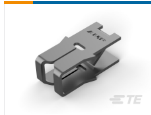
TE Part # 62429-1 MAG-MATE TERM 27-30 013TPBR