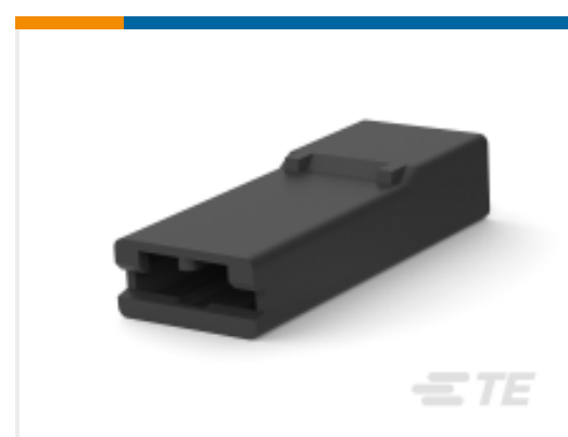
TE Part # 1-2133346-4 250 FASTON HSG.,REC.,1 POS,BLACK