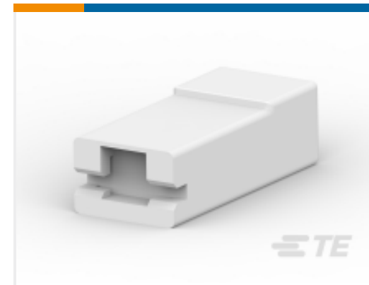
TE Part # 1-480418-0 205 FASTON HSG.,REC.,1 POS, NATURAL