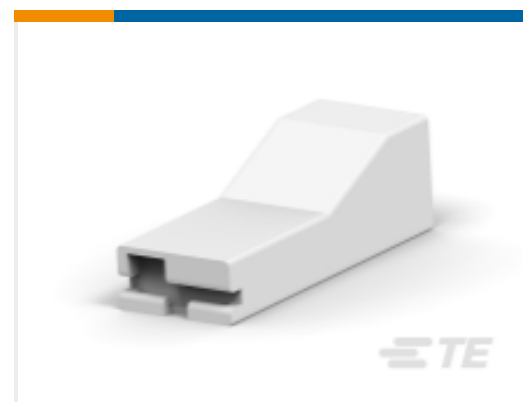
TE Part # 280233 250 FASTON POST INS.,1 POS, NATURAL