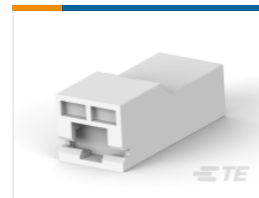
TE Part # 1969186-2 312 FASTON HSG.,REC.,NATURAL