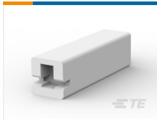
TE Part # 1-480417-0 110 FASTON HSG.,REC.,1 POS, NATURAL