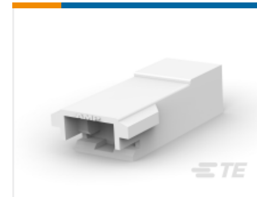
TE Part # 521053-1 250 FASTON HSG. REC 1P NATURAL