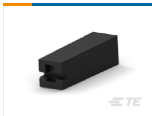
TE Part # 1-480417-1 110 FASTON HSG.,REC.,1 POS,BLACK