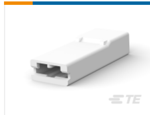
TE Part # 1-2133346-0 250 FASTON HSG.,REC.,1 POS, NATURAL