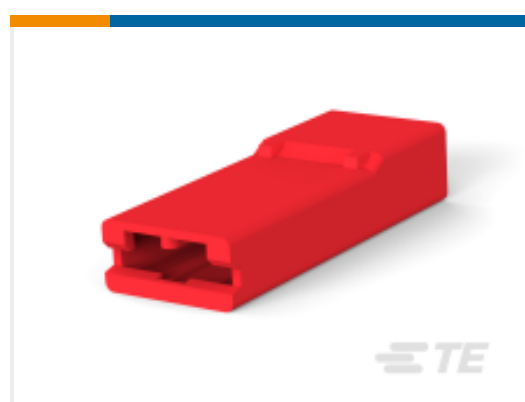
TE Part # 1-2133346-1 250 FASTON HSG.,REC.,1 POS,RED