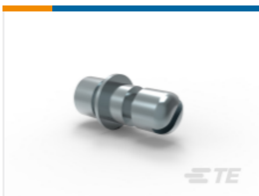
TE Part #1-2308273-1 QL-SET VAR A W/STP MO FOR COMBLOCK M3THD