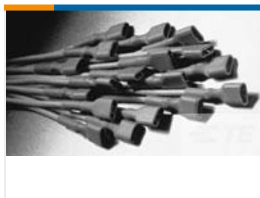
TE Part #6080774003 LSTT-19-4-SP