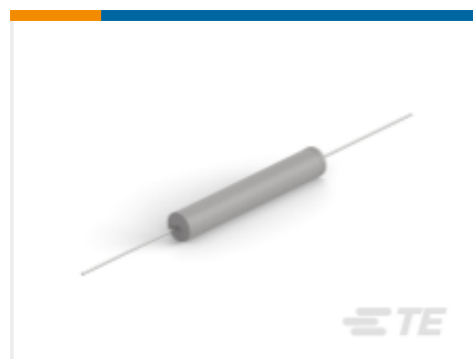
TE Part #1-2176416-5 9W STD M/OX 5% 200R