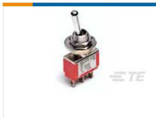
TE Part #2-1825138-2 A201SYAB04