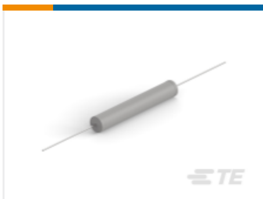
TE Part #2-2176416-7 9W STD M/OX 5% 620R