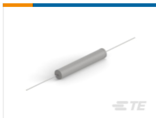
TE Part #8-2176416-5 9W STD M/OX 5% 160K