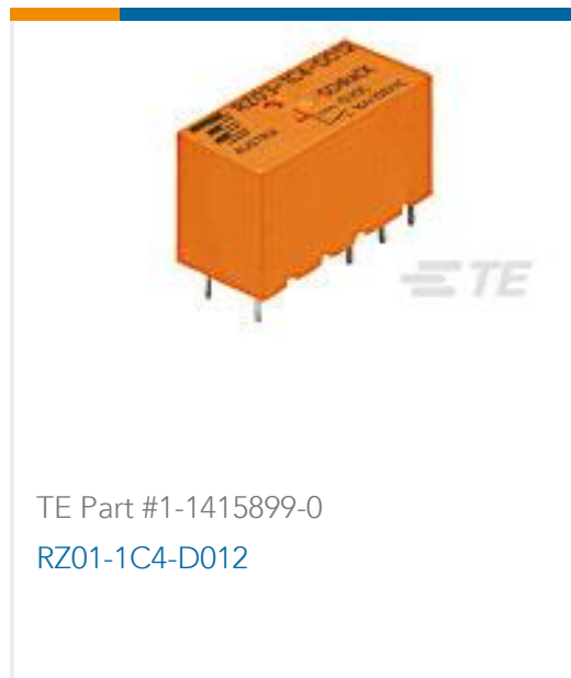
TE Part #1-1415899-0 RZ01-1C4-D012