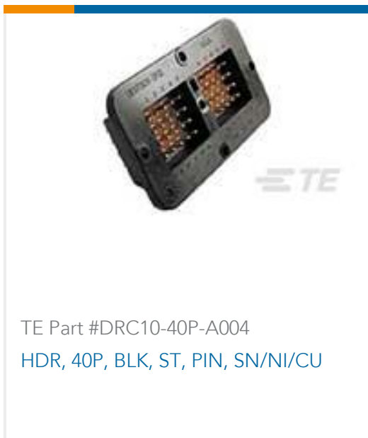
TE Part #DRC10-40P-A004 HDR, 40P, BLK, ST, PIN, SN/NI/CU