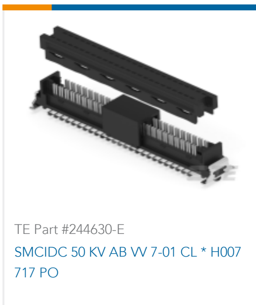
TE Part #244630-E SMCIDC 50 KV AB VV 7-01 CL * H007 717 PO