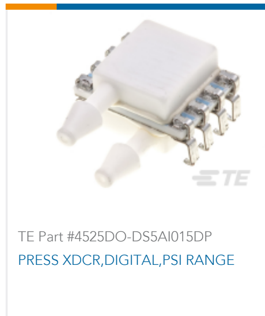
TE Part #4525DO-DS5AI015DP PRESS XDCR,DIGITAL,PSI RANGE