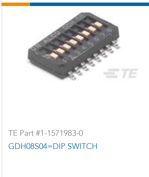
TE Part #1-1571983-0 GDH08S04=DIP SWITCH