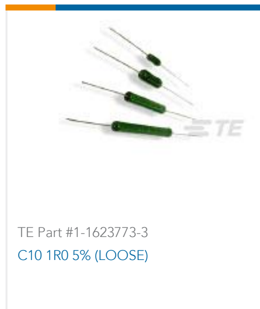
TE Part #1-1623773-3 C10 1R0 5% (LOOSE)