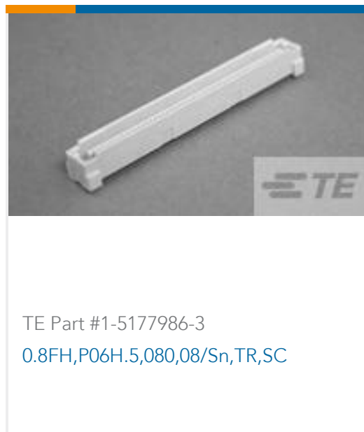
TE Part #1-5177986-3 0.8FH,P06H.5,080,08/Sn,TR,SC