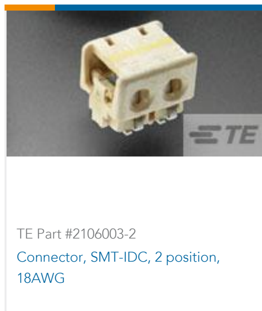
TE Part #2106003-2 Connector, SMT-IDC, 2 position, 18AWG