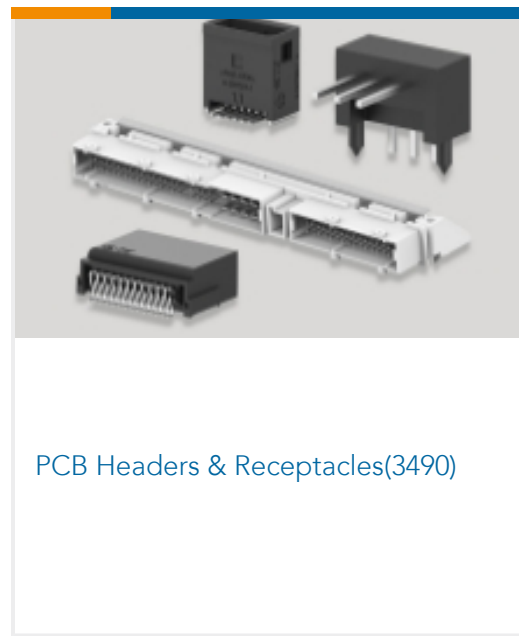
PCB Headers & Receptacles(3490)