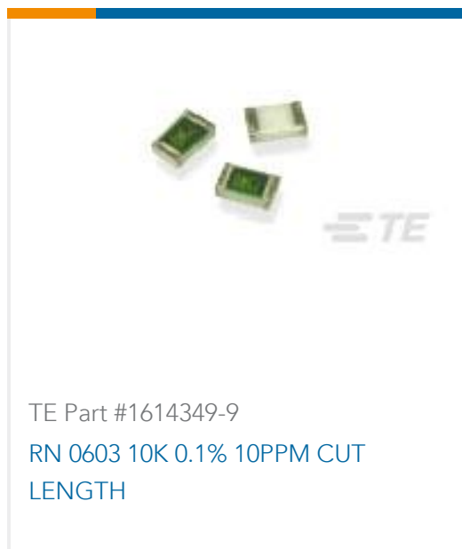
TE Part #1614349-9 RN 0603 10K 0.1% 10PPM CUT LENGTH