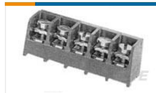
TE Part #1-1437653-4 6PCV-08-007=6PCV ASSEMBLY