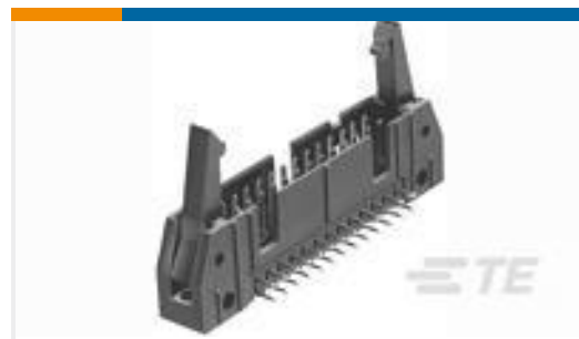
TE Part #499913-9 040 UNIV HDR RA 4S 15DP STD L2