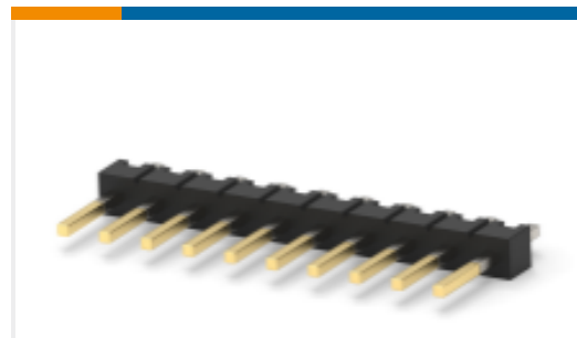
TE Part #6-146285-0 10 MODII HDR SRST B/A .100CL