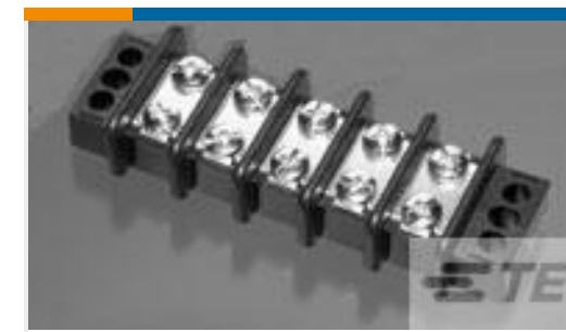
TE Part #1546311-2 2P .563" DR BARRIER,W/WASHER