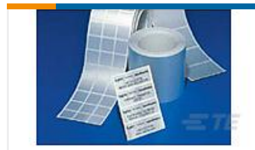
TE Part #F38449-000 MP-191114-15-8A