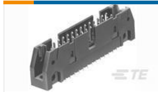
TE Part #102153-1 010 UNIV HDR SP 4S 15DP STD