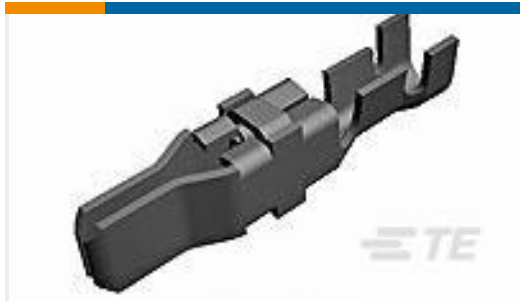
TE Part #66262-2 MALE CONTACT ASSY. (L.P.)