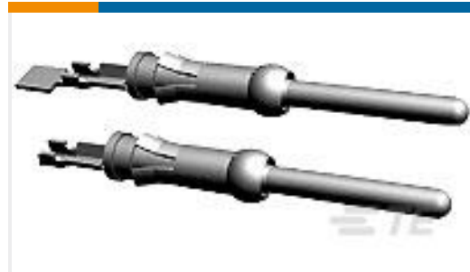
TE Part #1-66400-0 III+ PIN, 24-20, TIN, LP