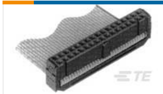
TE Part #1-1658622-0 50 NOVO MIL/CTR 30DP, LEAD FREE