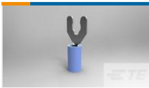
TE Part #8-52936-1 TERMINAL,PIDG SPR SPD 16-14 8