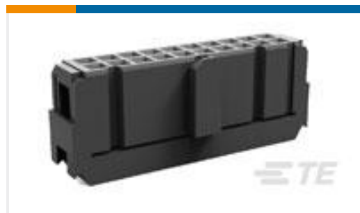
TE Part #1-1658621-0 50 NOVO MIL/CTR 15DP, LEAD FREE