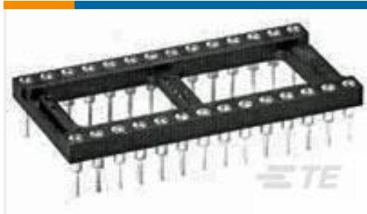
TE Part #2-1571586-9 828-AG11D-LF=800 DIP, PCB, AU/SN