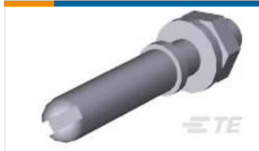
TE Part #200389-2 GUIDE PIN KIT