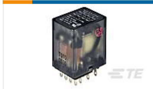
TE Part #6-1393122-7 KHAU-17D12N-110=KH