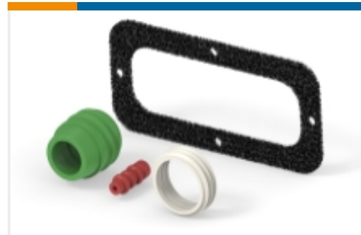
Connector Seals & Cavity Plugs(11)