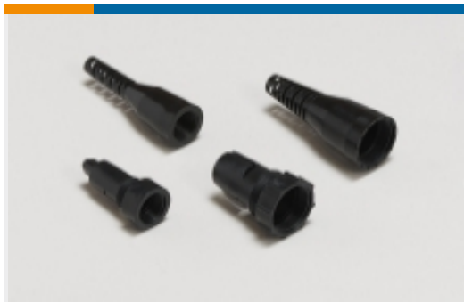
Connector Strain Relief(5)