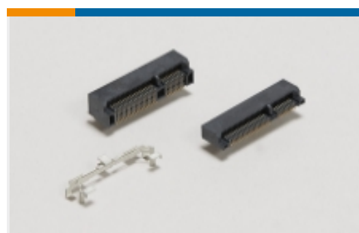
Mini PCI Express & mSATA(1)