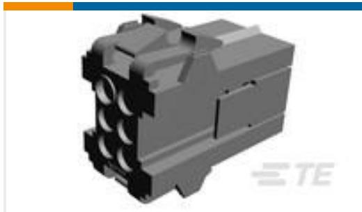
TE Part #207153-1 6 POS SQ GRID METRIMATE-RCPT