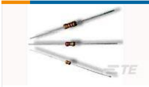
TE Part #3-1623932-6 CFR50 5% 1K0