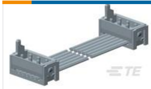
TE Part #1483351-3 MICRO-MATCH LEAD 06P 250MM