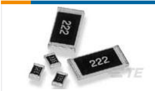
TE Part #5-1879501-7 CRGH2512 5% 220R 2W