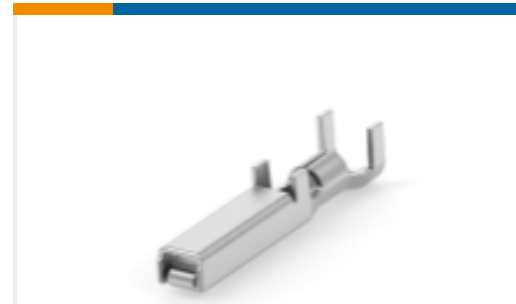
TE Part #353716-2 DYNAMIC 3000 CONTACT