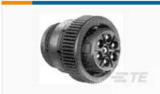
TE Part #211766-1 CPC PLUG ASSEMBLY SIZE 17-9