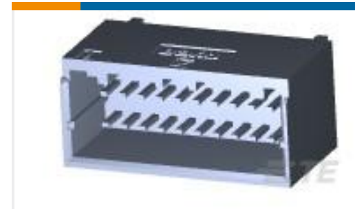
TE Part #1-1827872-1 DYNAMIC 1100D HDR ASSY V 22P BLACK GOLD