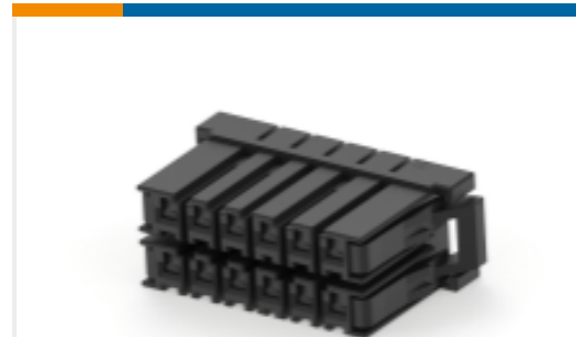
TE Part #1-179555-8 Receptacle and Tab Housing: 5.08 mm Pitch, 250-600V