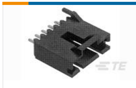
TE Part #104809-6 07 MTE HDR SRST LATCH W/HLDWN