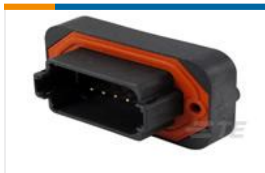
TE Part #DT15-12PB-G003 HDR, 12P, BRK, ST, AU/NI/CU, B