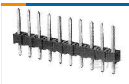
TE Part #826938-4 4P AMPMODU II STIFT LEI