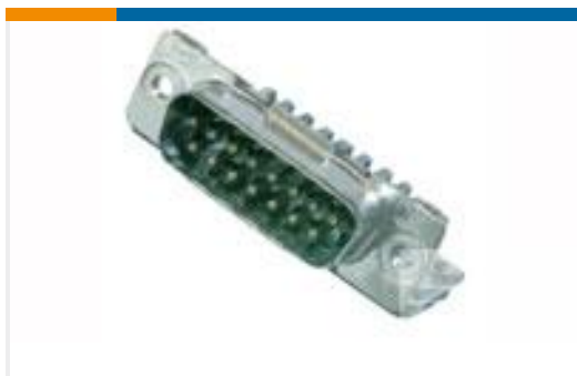
TE Part #5-338169-2 15P HDP20 PLUG ASSY