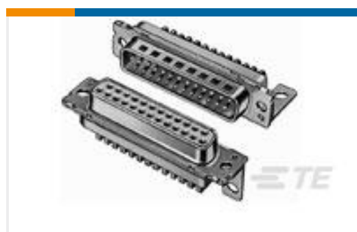
TE Part #3-1393480-3 V23529B1122C215=SUB D STIFTEL