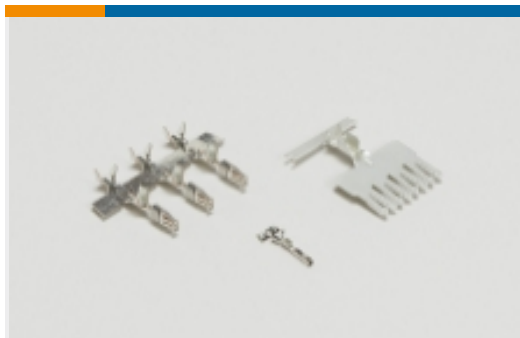
Busbars & Terminals(1)