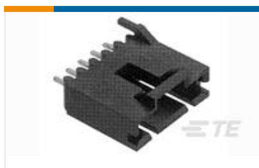
TE Part #104809-4 05 MTE HDR SRST LATCH W/HLDWN