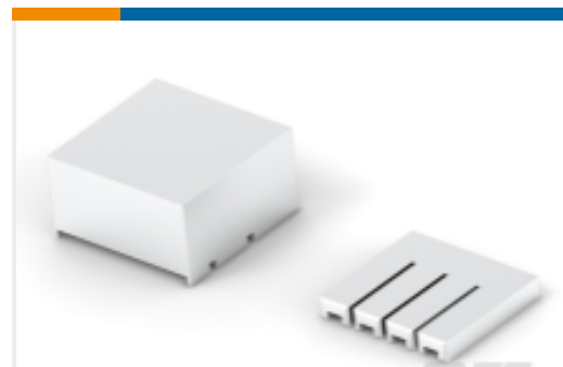
TE Part #1725761-1 KIT,SEATING TOOL, 1X4