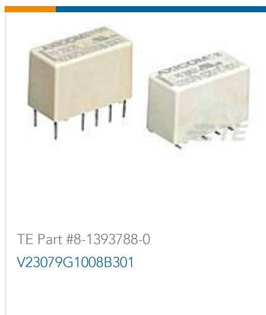
TE Part #8-1393788-0 V23079G1008B301