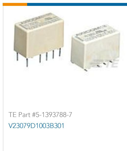
TE Part #5-1393788-7 V23079D1003B301