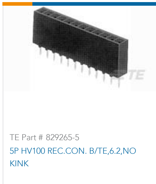
TE Part # 829265-5 5P HV100 REC.CON. B/TE,6.2,NO KINK