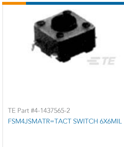
TE Part #4-1437565-2 FSM4JSMATR=TACT SWITCH 6X6MIL