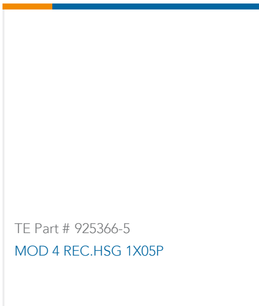
TE Part # 925366-5 MOD 4 REC.HSG 1X05P