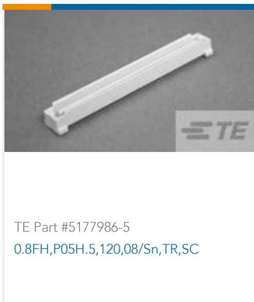
TE Part #5177986-5 0.8FH,P05H.5,120,08/Sn,TR,SC