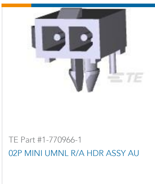
TE Part #1-770966-1 02P MINI UMNL R/A HDR ASSY AU