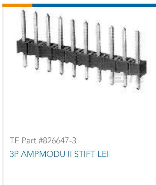
TE Part #826647-3 3P AMPMODU II STIFT LEI