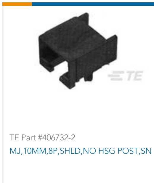
TE Part #406732-2 MJ,10MM,8P,SHLD,NO HSG POST,SN