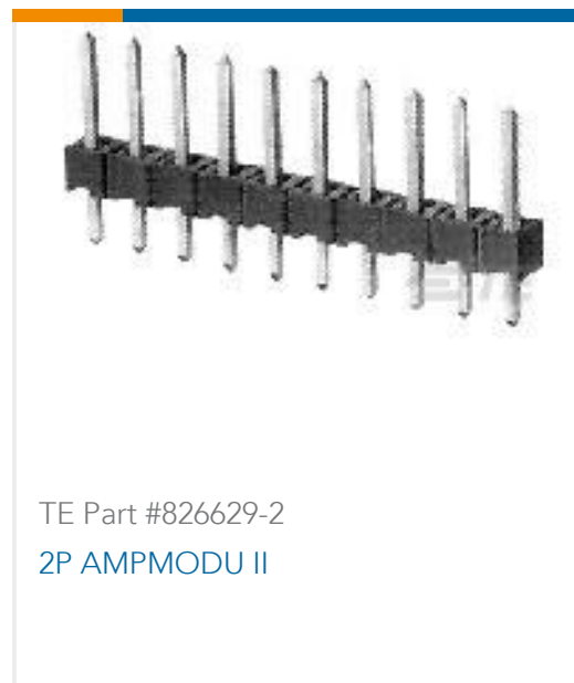
TE Part #826629-2 2P AMPMODU II